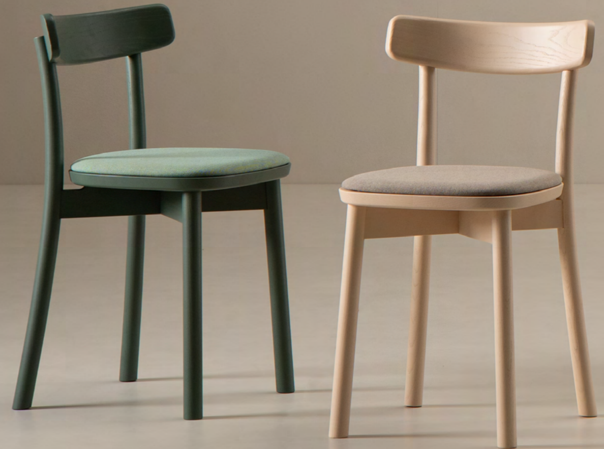
FONDINA W11 Sage, Fixed Cushion, Vescom Acton 7062.29