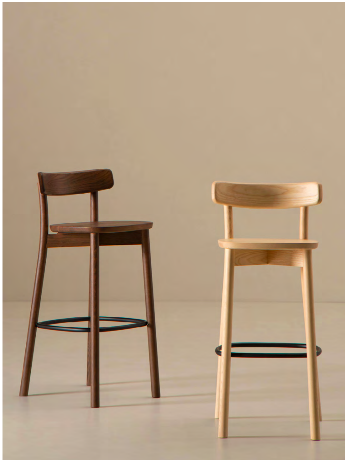
FONDINA W9 Natural Coral Vescom Acton 7062.05