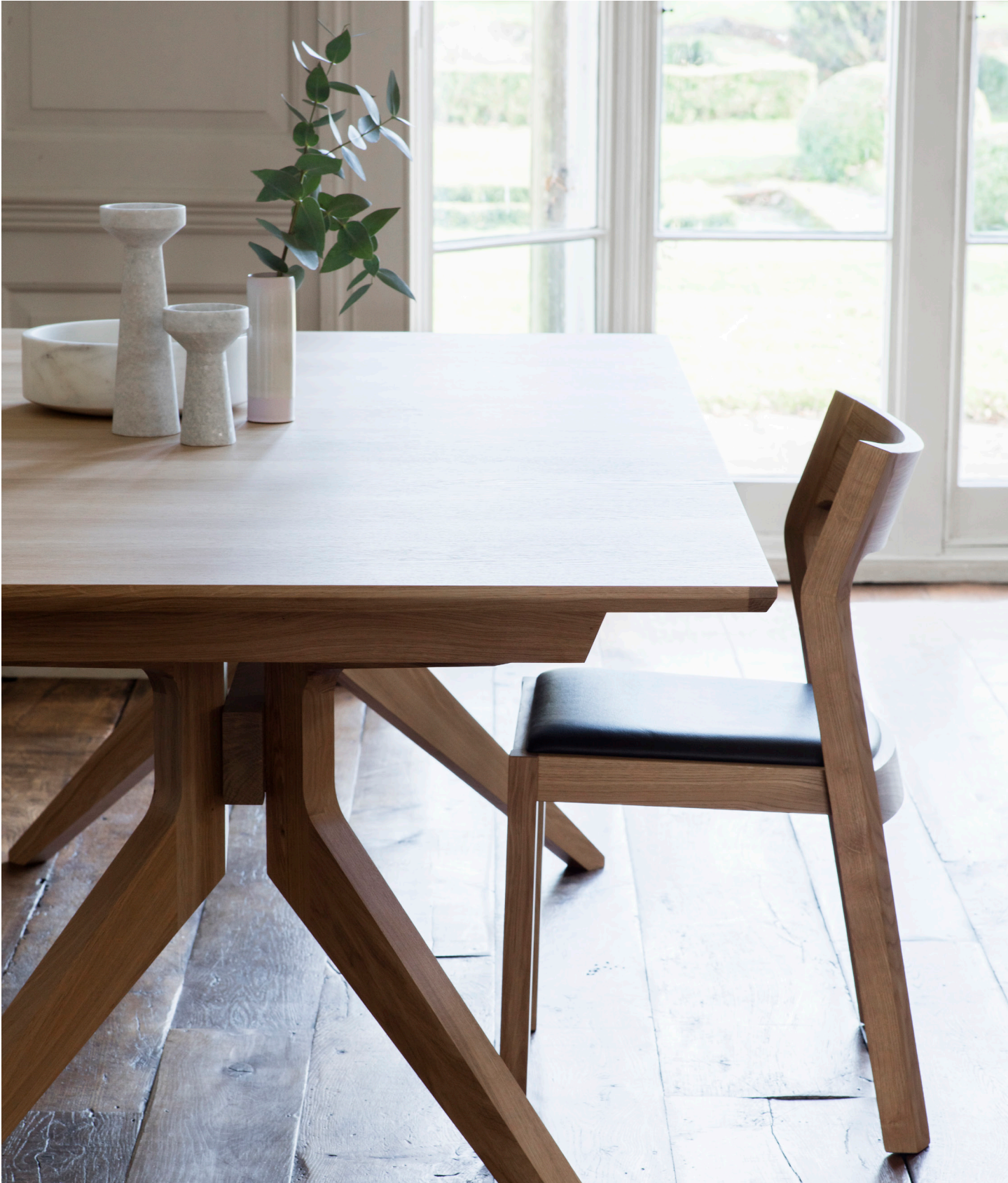
Cross Extending Table by Matthew Hilton